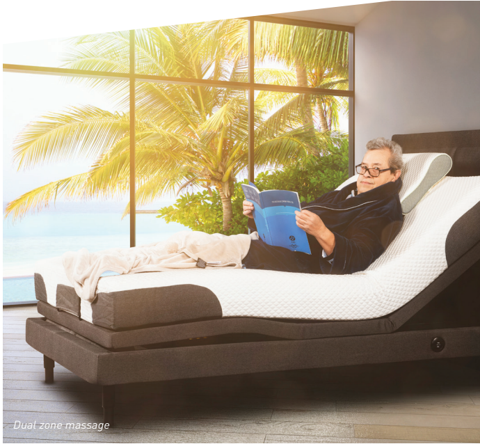
Dual zone massage