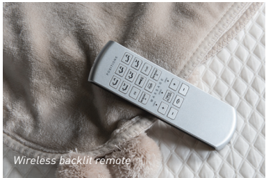
Wireless backlit remote

USB Power Ports: Connect two USB chargers on each side of the base for powering your devices while you relax or sleep.