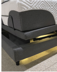
Under bed night lights